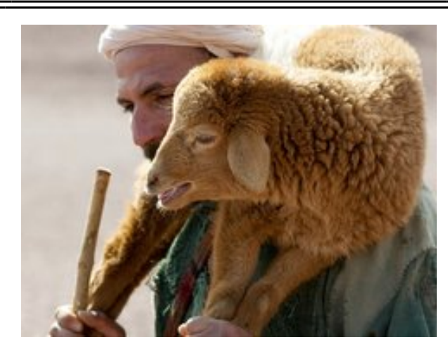
15 'Then he calls his friends and neighbours together and says, "Rejoice with me! I have found my lost sheep."